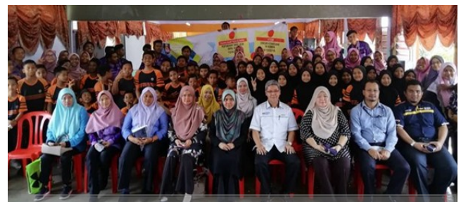
Photographic sessions between all participants and VIPs